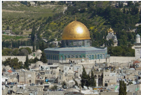
Dome of the Rock and Temple Mount